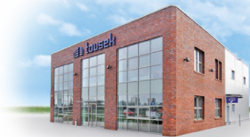
tousek NV Benelux www.tousek.com