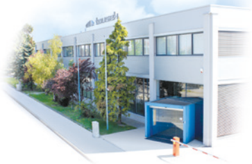
tousek Ges.m.b.H. Austria - headquarters www.tousek.at