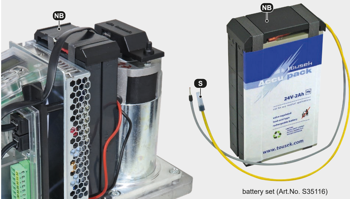
battery set (Art.No. S35116)